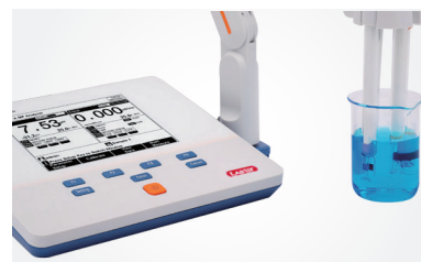
Automatic identification standard solution Fast calibration and more accurate measurement